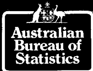
Manufacturing Division Base:1988-89 = 100.0